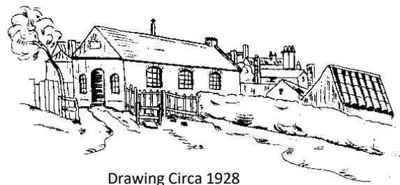
Drawing Circa 1928

Hermitage Primary School currently has over 400 children ranging from Nursery to year 6 (3-11 years). Our current building is 12 years old and is much more modern and spacious, featuring a well-resourced Library, a Home Economics room and a Multi-Use Games Area (MUGA) in the playground.